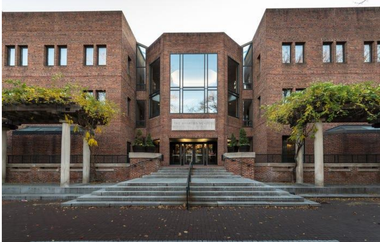
The Wharton School.