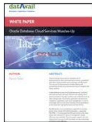
ORACLE DATABASE CLOUD SERVICES MUSCLES-UP