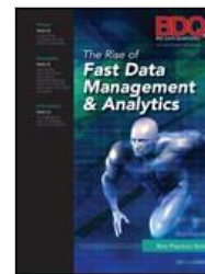
THE RISE OF FAST DATA MANAGEMENT & ANALYTICS