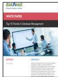
TOP 10 TRENDS IN DATABASE MANAGEMENT