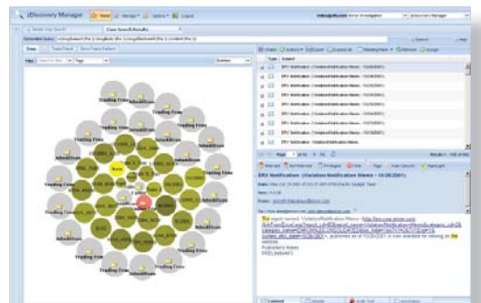
ZL Advanced Data Analytics

With ZL compliance, organizations can satisfy the retention and supervisory review requirements of numerous regulations (SEC 17a-4, NASD 3010, FERC 717, etc.) while ensuring a rigorous way to enforce internal corporate governance policies. Messages are flagged using a lexical system that relies on deep content analysis and contextual filters catching over 99.99% of violations. ZL enables compliance officers to monitor, prevent and immediately respond to noncompliant messages, as well as conduct random sampling and targeted review through a centralized dashboard.