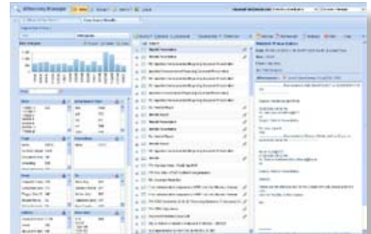
ZL E-Discovery Review

Reducing storage requirements on expensive production servers is a constant struggle for IT departments. ZL UA can offload data from these servers into a lower-cost archive, leaving behind a small link, or stub, to the original content. ZL also solves the problem of data redundancy with Global Single-Instance Storage (SIS). By utilizing a single database and index across data sources, ZL can avoid archiving duplicates. Utilizing “stubbing” and ZL’s Global SIS can decrease storage requirements on production servers by up to 95%, thereby saving considerably on storage and administrative costs.