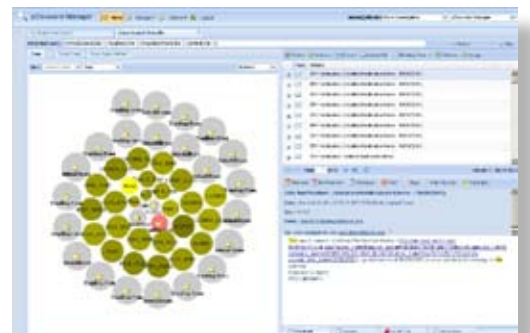
ZL Advanced Data Analytics

With ZL compliance, organizations can satisfy the retention and supervisory review requirements of numerous regulations (SEC 17a-4, NASD 3010, FERC 717, etc.) while ensuring a rigorous way to enforce internal corporate governance policies. Messages are flagged using a lexical system that relies on deep content analysis and contextual filters catching over 99.99% of violations. ZL enables compliance officers to monitor, prevent and immediately respond to noncompliant messages, as well as conduct random sampling and targeted review through a centralized dashboard.